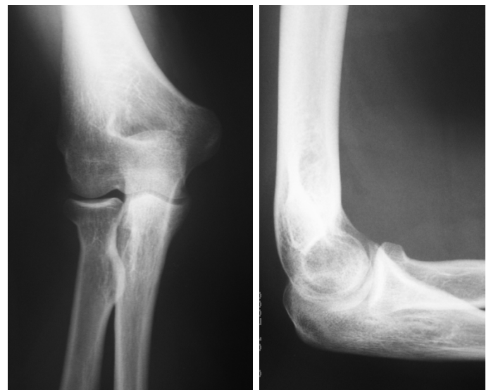
Figure 1 and 2. X-rays investigation of the right elbow

immediate disappearance of the pain and a recovery of the elbow mobility. Histological examination confirmed the diagnosis of osteoid osteoma. Thirteen months after surgery, the elbow was painless, with complete mobility, and radiological control showed the ossification of the resected bone core.